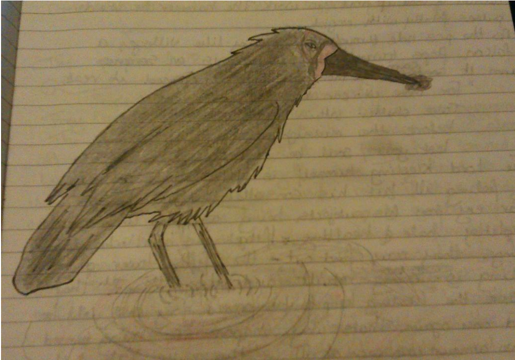
Figure 1 Death Vigil