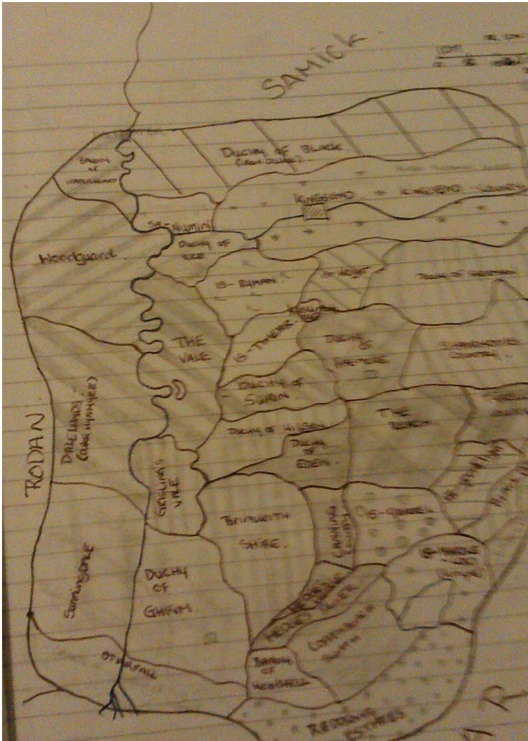
Figure 2SaSurin Political boundaries